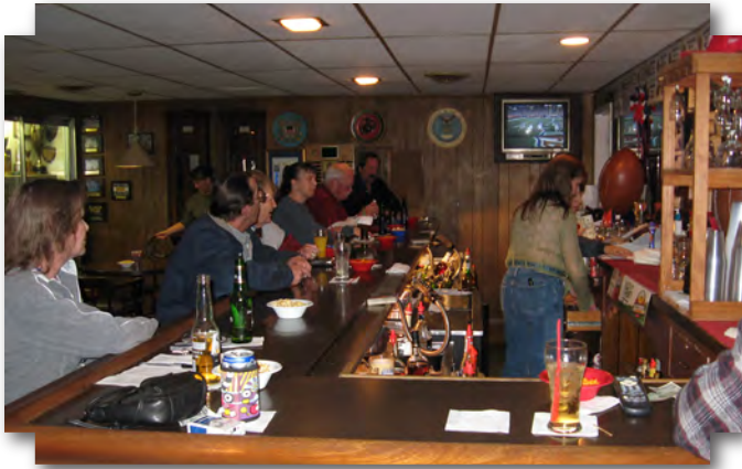
Football fans gathered throughout the Post Hall on Super Bowl Sunday to root for their favorite team.