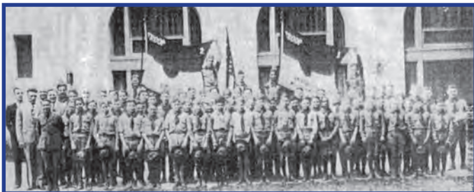
Post 77 first sponsored a Boy Scout troop in the 1920s. Here are members of Post 77's Troop 1 in 1930, along with members of Woodland Troop 2.