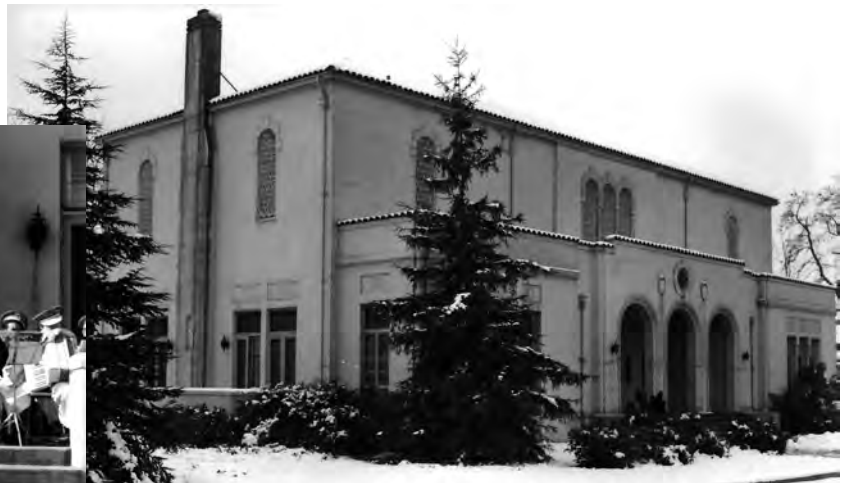
The Elks Club - The big snow of 1937