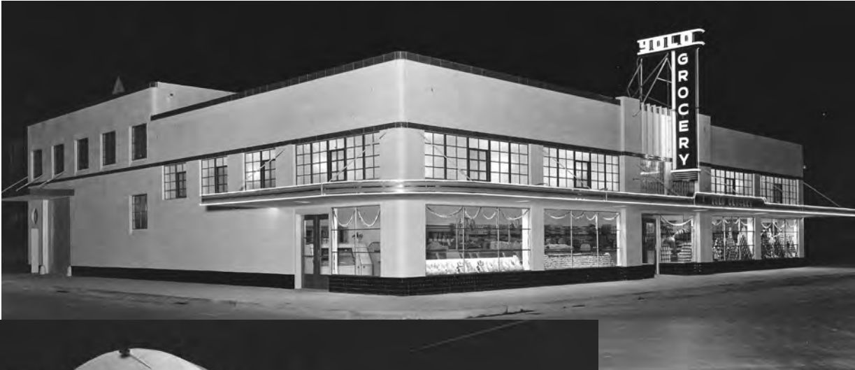
Yolo Grocery Grand Opening 1937 Now a Mexican restaurant south of Morrison's