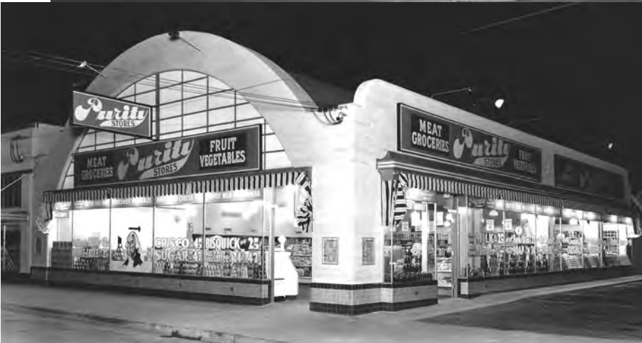
The Purity Store built 1938 Now the All Action Awards